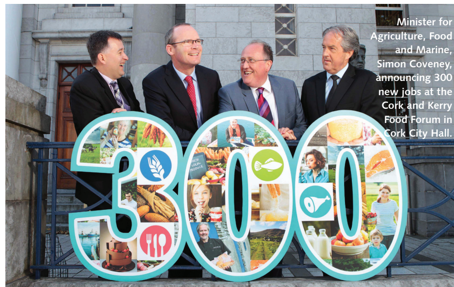
Minister for Agriculture, Food and Marine, Simon Coveney, announcing 300 new jobs at the Cork and Kerry Food Forum in Cork City Hall.